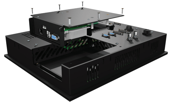
Back view showing optional field swappable integrated computer