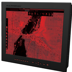
Red Monochrome Night Mode View

While we strive to ensure the accuracy of all items and descriptions in this document, this is not always possible. Specifications, options, and availability subject to change with out notice. Errors and omissions excepted. We reserve the right to limit quantities.