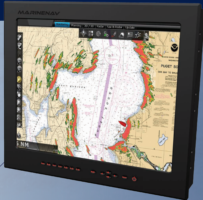
FRONT VIEW OF BRIDGEVIEW 19" DISPLAY

Built North Atlantic Tough Trusted Everywhere