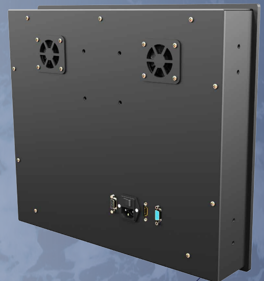
BACK VIEW OF MAR-19 DISPLAY