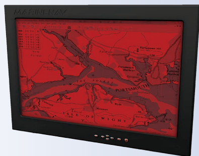
Red Monochrome Night Mode View (24" Monitor)

* Product must be registered within first warranty year.