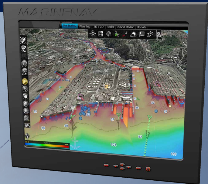
FRONT VIEW OF MAR-19 DISPLAY