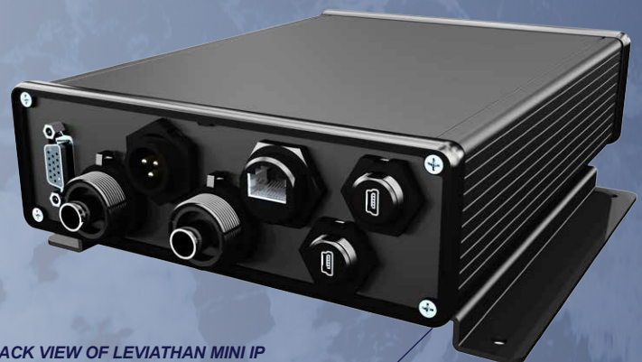
BACK VIEW OF LEVIATHAN MINI IP